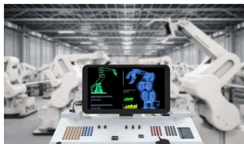
FIGURE 1. automotive industry

Production of metal stamping The forming process is important in the production of metal products. Including industrial assembly of vehicles Electronics Manufacturing And electronics industries, which each manufacturing plant is equipped with features such as process design process. Through the process of adding value to the product, which is material to the plant operation is carried out went well. In order to make it capable of higher production. The technology is capable of processing the physical limitations of the product and production capacity. Or the ability of the manufacturing process, the process of manufacturing parts automotive industry in the mass needed for the manufacturing process with a special tool called a "mold" the process of cutting generally require technical help in the design. reduce both direct and indirect, that might happen. The first since the end of the manufacturing process by reducing the pressure to cut is necessary because it can reduce the pump. Reduce noise pollution caused by the cutting. Reduce the vibration of the pump. Reducing cutting forces cannot simultaneously cut and shaped pieces (Huseyin Selcuk Halkaci, 2014).