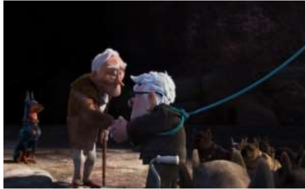
Figures: Carl Fredricksen, Russel and Charles Muntz