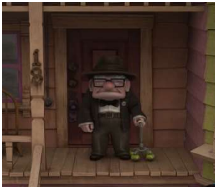
Figures: Carl Fredricksen as the main character

This section described about character of Carl Fredricksen as the main character. According to Wellek and Warren (1962), character is the figure that participates in the action or the people who play roles in a story and it is expected to be natural lifelike. In this case, naming is important to reflect the life, the spirit, and the individual of each character in the story.