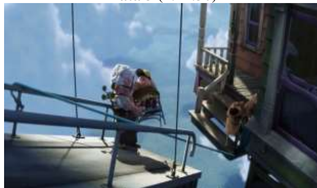
Figures: Carl Fredricksen, Dug and Russel Source: UP 2009 movie

Mr. Fredricksen: (throw the hose and save russel)