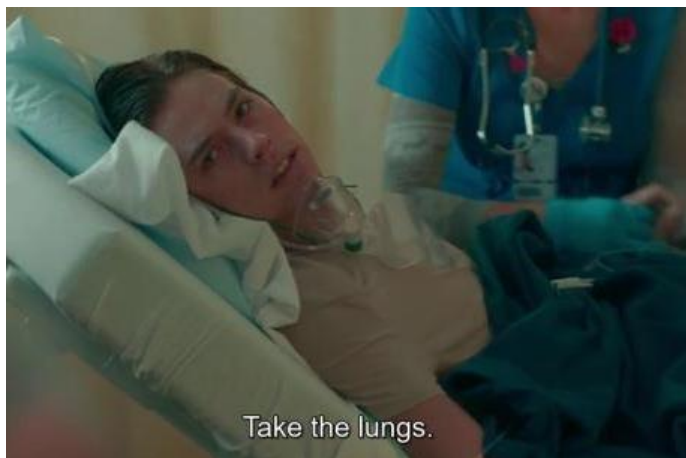
Figure 8 Will Assures Stella To Take The Lungs

Erin : “Stella, we've been waiting for these lungs for years. What are you talking about? If you don't use the lungs, they're wasted, sweetie.”