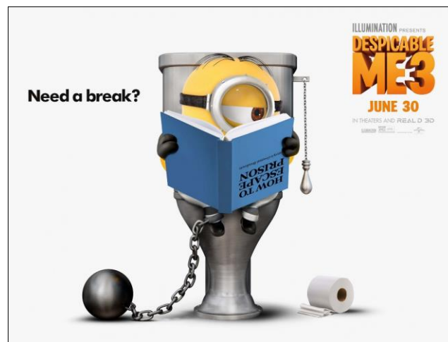
Figure 3. Movie Poster of Despicable Me 3

On the movie poster of Despicable Me 3, there were found five verbal signs. The first verbal sign Need a Break? denotatively indicates the movie tagline in the poster. This verbal sign is categorized as an interrogative sentence, which in connotative meaning is used by the creator to describing how the Minions questioning Gru's decision that want to retire from doing something bad. It also indicates as a reflection of how the Minions are disappointed with Gru's decision. The second verbal sign is Illumination Present , which in denotative meaning indicates the name of the company production. This verbal sign, in connotative meaning is used to inform the audience that this movie was made and presented by the company for the audience, especially for the audience that really loves the Despicable Me series movies. The third verbal sign in the poster is DESPICABLE ME 3 , this sign denotatively indicates as the main titled of the movie. That in connotative meaning is used to inform the audience, this movie is the prequel of the movie series of Despicable Me. Because this movie brings us back to the flashback life of Gru before their parents get divorced and he separated from his twin brother Dru.