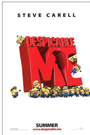
Figure 1. Movie Poster of Despicable Me

In the first movie poster, there are found 4 verbal signs in the poster. The first verbal sign is DESPICABLE ME . Denotatively, this sign is indicated as the main title of the movie. Meanwhile connotatively, this verbal sign is referred to describe the main character's bad action in the movie because the main character in the movie is told as a professional thief who likes to steal unusual objects, that's why it can be said that sentence is used to describing the main character, characteristic in the movie. The other verbal signs are STEVE CARELL , SUMMER , and www.despicable.me . These signs have denotative meaning that are as the name of an actor, the certain time in a year, and a link address. But in this poster, those signs connotatively giving information about the movie, they are (1) a famous actor that is filling the voice of the main character in this animated movie, (2) this movie will be released in summer, and (3) the audience can have more information about this movie through the link address.