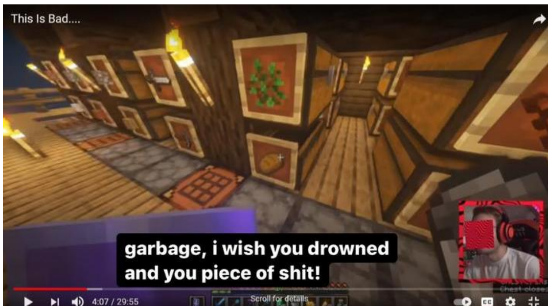
Swear Words: shit

According to Wardhaugh (2010) the swear words that created by the original word of human’s or excretion system and usually considered as dirty and impolite, is called Excretion Type. In the example above, its shows how PewDiePie used ‘ shit ’ which is dirty word in his expression of annoyance by something. So it can be concluded that