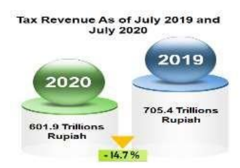
Fig. 1. Tax Revenue July 2019 and July 2020.