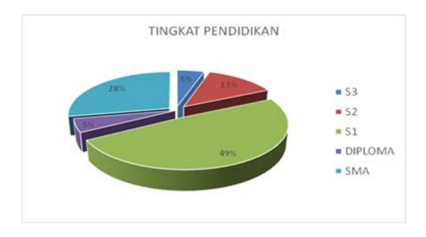
Fig 4. Distribution of questionnaires based on education

Infrastructure development that involves the wider community and touches local wisdom in its design and utilization needs to be studied more deeply. Vertical holiness as local wisdom is generally supported by a culture that is rooted and ingrained in Hinduism. Therefore, every step and action must follow the rules that have become customary in society. Habits that eventually become role models in the implementation of building construction include setting the height and level of the building, the position / layout of the building which is often referred to as elbow or gegulak in regulating the distance and dimensions of the buildings used.