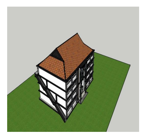
Fig 1. Multi-storey building with outside staircase design