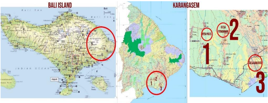
Fig. 1. Research Location Map of Wild and semi Wild Edible Plant

west with Selumbung Village. Ngis Village has an area of \pm 556,505 ha. With a rice field area = 0.5 ha, dry land = 404.25 ha. Total population = 1601 inhabitants. The location is in the position of 8000'00 " - 8041'37,8"LS and 115035'9.8 " - 115054'8.9"Et [19]. The Ngis people rely on local plant resources for various daily needs. The livelihood system can be described as a mixed farming system which is dry land farming. The production plants cultivated are Cocos nucifera L. , Musa paradisiaca L., and Theobroma cacao L. Research Map showed as bellow: